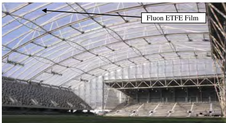
The interior of Forsyth Barr Stadium

Forsyth Barr Stadium's roof covers 20,000 square meters, and is composed of sheets of clear, lightweight film with a thickness of 0.2mm installed by Vector Foiltec Ltd. The stadium, completed in early August, will host several notable fixtures in the world's top rugby event taking place this September 9 to October 23. In addition to sporting events, the multi-purpose, all-weather stadium can also host events, concerts and trade shows, offering visitors the visual spaciousness and abundant sunlight of an open environment, while protecting them from wind, rain and snow during poor weather.