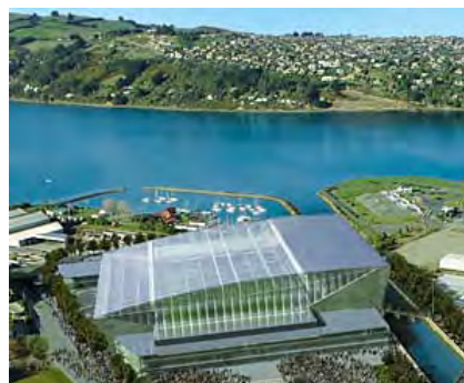
Forsyth Barr Stadium

AGC's fluoropolymer film was chosen for its lightness, which facilitated construction, and its high sunlight transmission rate exceeding 90%, which creates ideal conditions to enhance visual spaciousness and adequately cultivate the natural turf. Further, the material is highly weather-resistant and so has an exceptionally long life span, resulting in minimal impact to the environment. It is also non-viscous, which makes it difficult for the surface to become soiled.