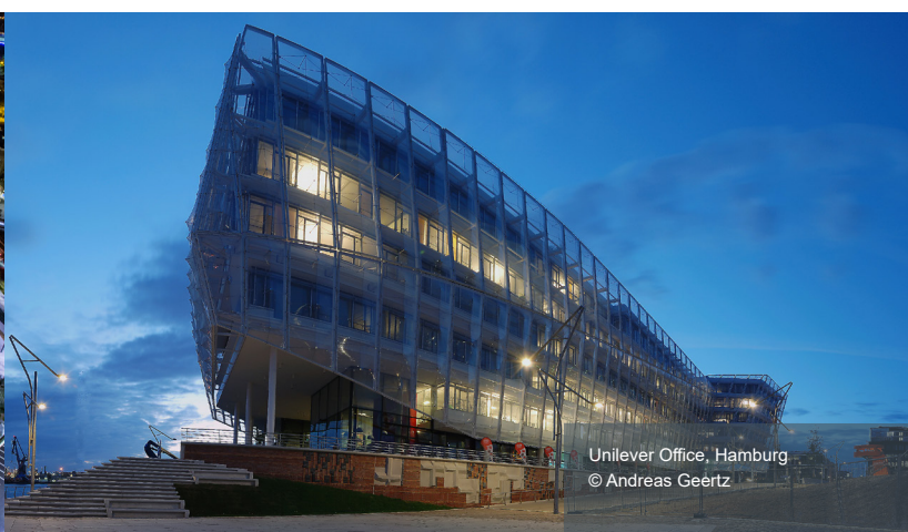
Unilever Office, Hamburg