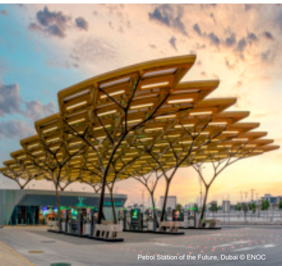
Petrol Station of the Future, Dubai